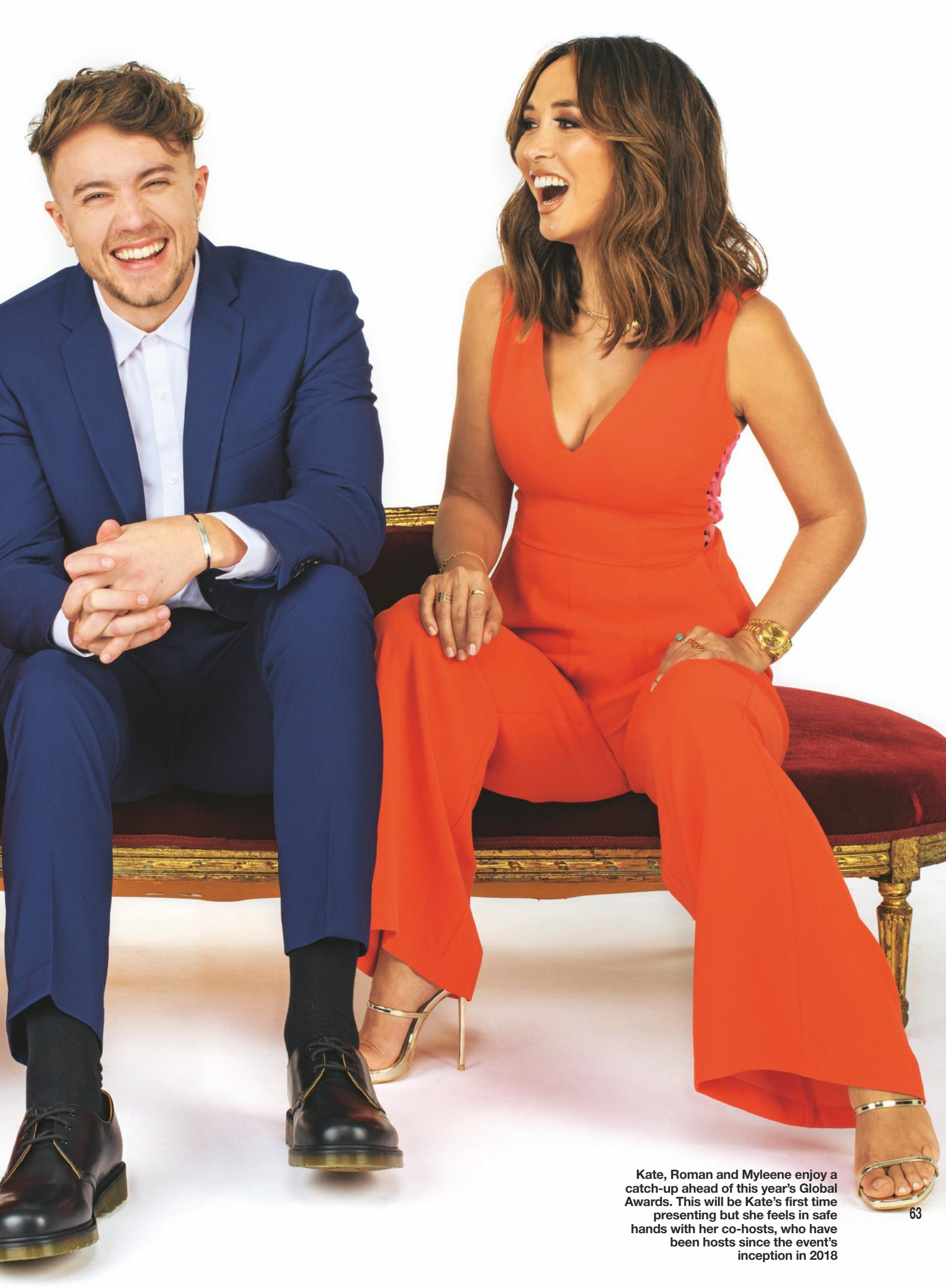
Kate, Roman and Myleene enjoy a catch-up ahead of this year's Global Awards. This will be Kate's first time presenting but she feels in safe hands with her co-hosts, who have been hosts since the event's inception in 2018