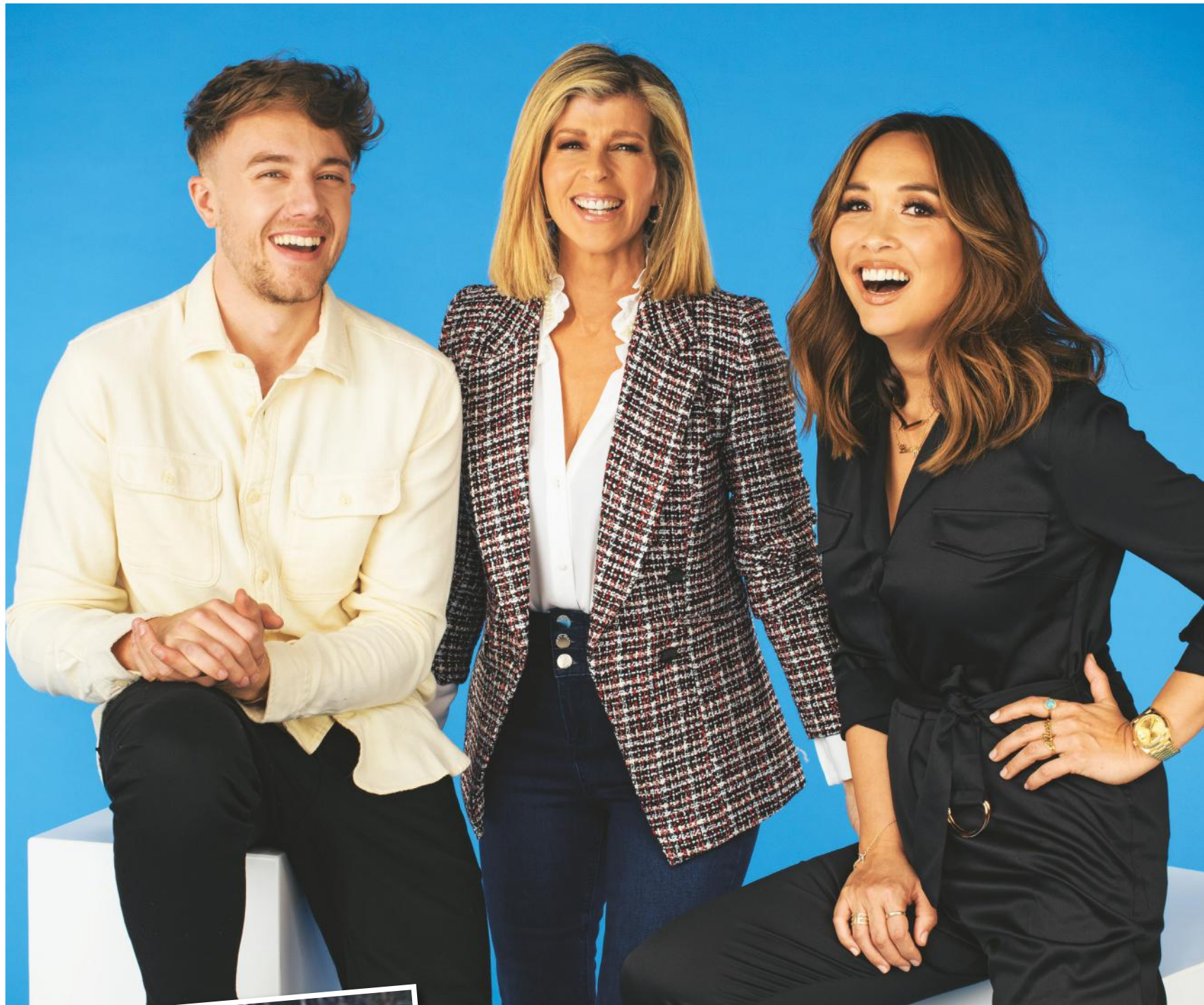
As well as being presenters on Global radio stations, the terrific trio (above) also share the experience of having been on I'm a Celebrity... Get Me Out of Here! , with Myleene (left) coming second in 2006, and Roman and Kate (below) coming third and fourth respectively last year