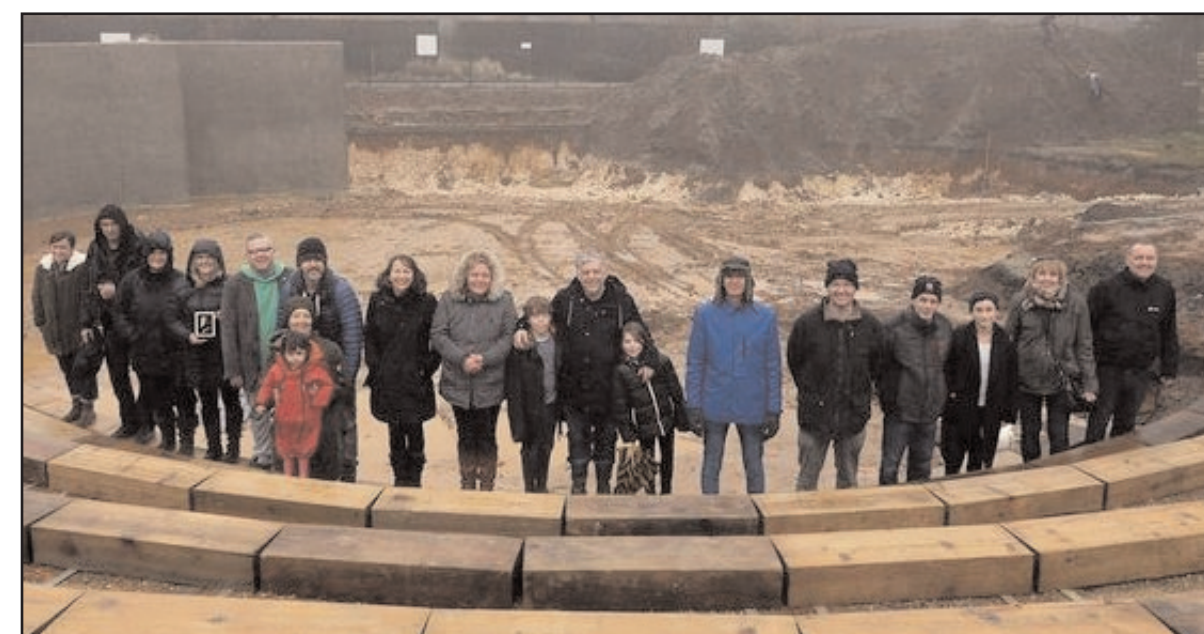
The group behind the Brighton Open Air Theatre Project at the site.