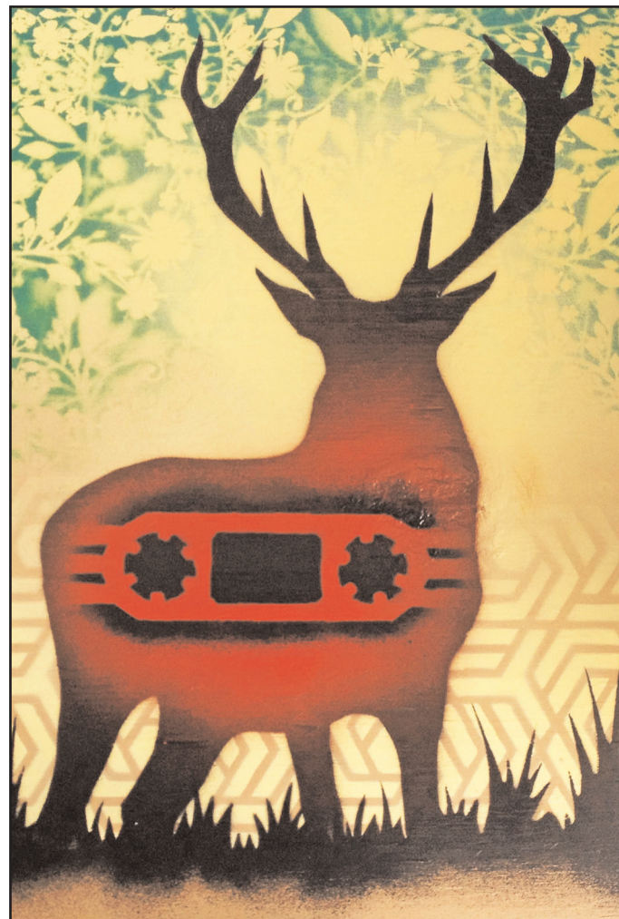
Haunted Stag-sette by Cassette Lord