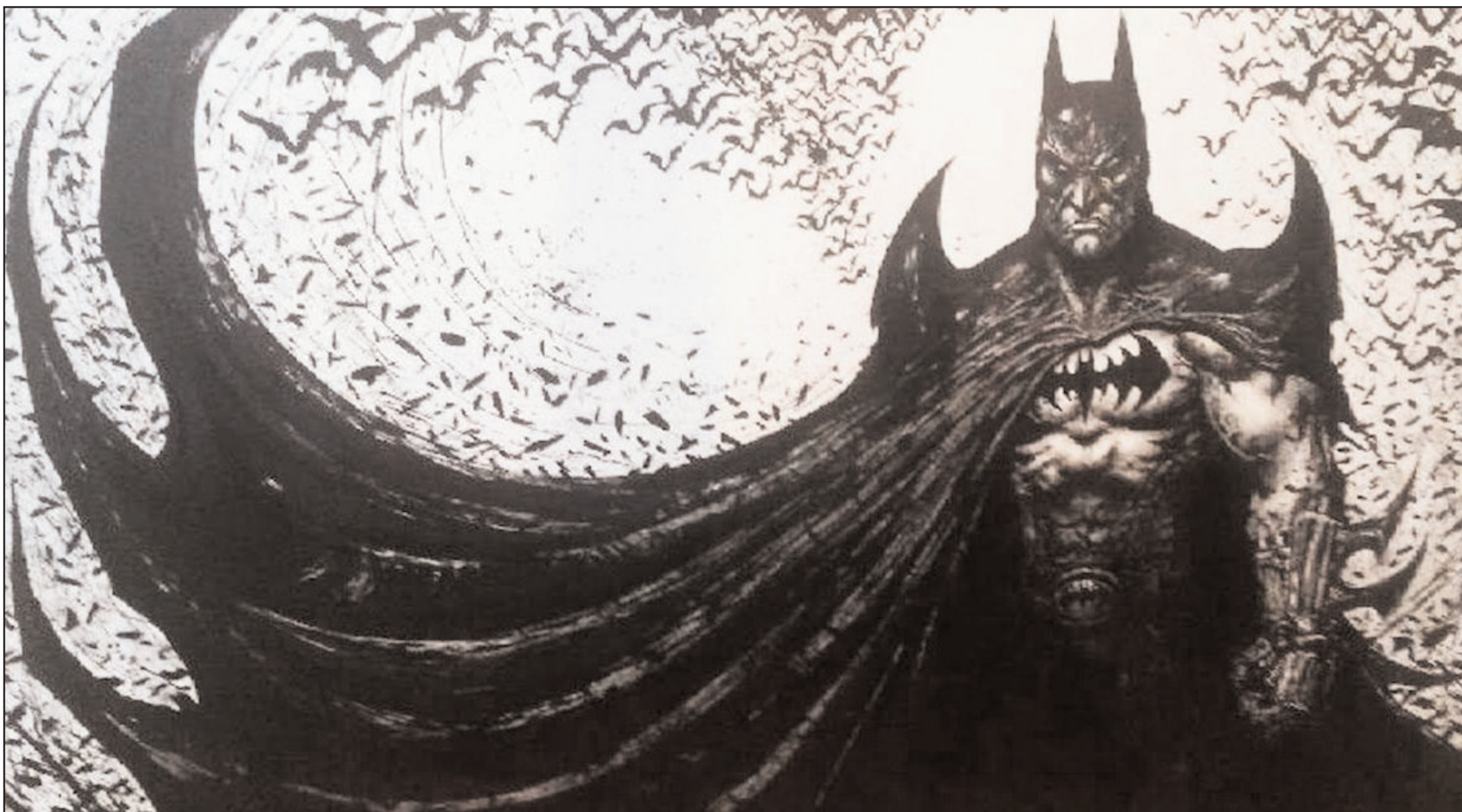
Clint Langley's Batman: Dark Night ink and acrylic