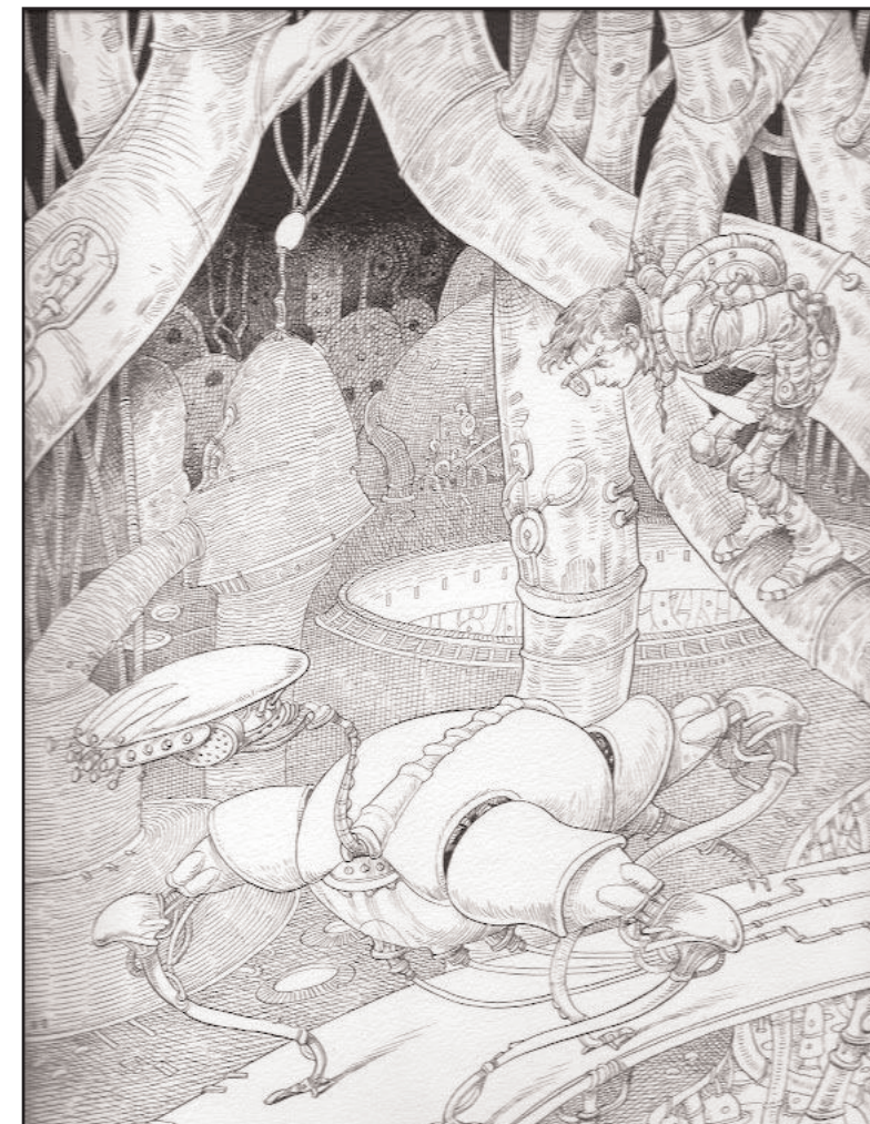
Chris Riddell's 'Scavenger' Sci Fi Concept Illustration